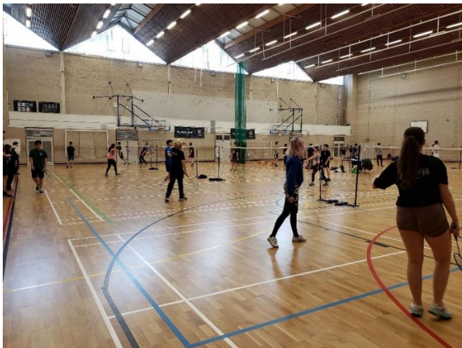
University of Exeter Sports Hall in Streatham Campus

There is a sports hall in the Streatham Campus, and a sports center in St Luke's Campus. Through the online system, you can book the badminton court, basketball court, tennis court etc. Bookings can be made at a fee, and borrowing sports gear will cost extra. Alternatively, you can join a sports club like I did. I joined the badminton club, paid £47 for membership, and could join the club's badminton sessions and borrow gear for free.