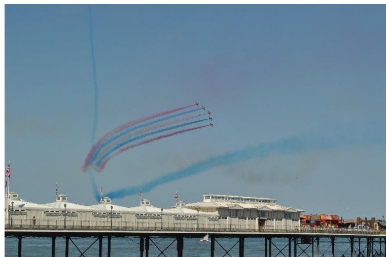
The Royal Air Force Aerobatic Team performing in the English Riviera Airshow

The English Riviera Airshow on Paignton beach is the most unforgettable event. There were astonishing aerobatic displays that stunned everyone. On 17/6, a military parade was held in London to celebrate the King's official birthday. I went to Buckingham Palace and had a glimpse of the royal family on the palace balcony.