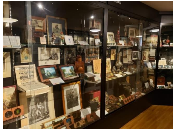
Bill Douglas Cinema Museum

I spent the entire March in Exeter, busy with the assignments which were due at the end of the month. I got to work on two essays, and one database project. Yet, there are still a lot to explore in Exeter. I visited the Bill Douglas Cinema Museum on the campus. It is a small museum which collects a number of artifacts related to the filmmaking industry. I also went bowling, kayaking, and cycling in Exeter.